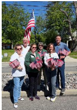
Enjoyed running into some of the members of the Parma Heights City Council at Parma Heights' Memorial Day Parade