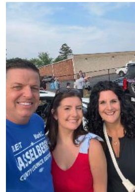
I had a great time participating in the Middleburg Heights Summer in the City Parade in June. There was plenty of family-friendly entertainment!