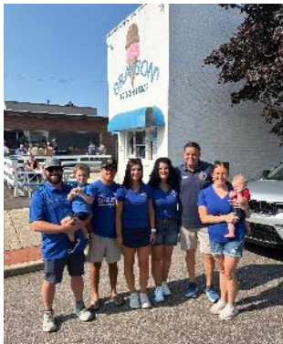
Enjoyed another great year walking in Parma's Independence Day Parade. It was great to see so many friends along the parade route.