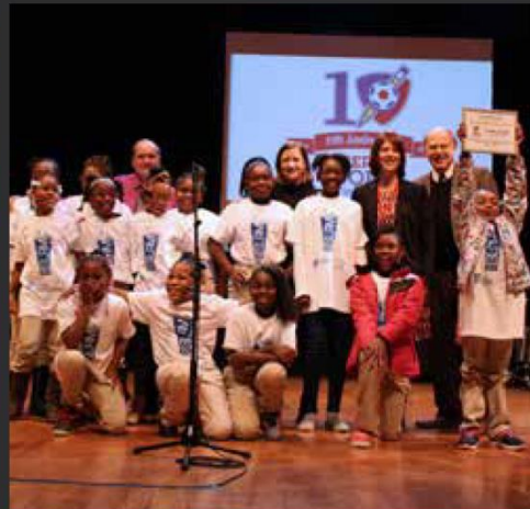
AMERICA SCORES CLEVELAND

CAC-funded organizations served 1.4 million children in 2013 and offered: