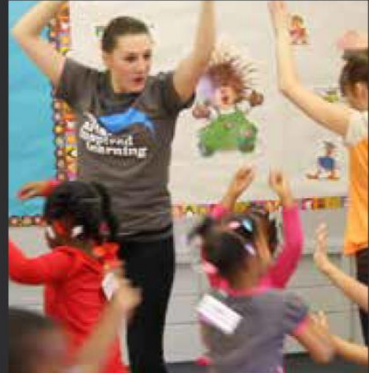
CENTER FOR ARTS-INSPIRED LEARNING

And 418,833 residents attended classes and workshops.