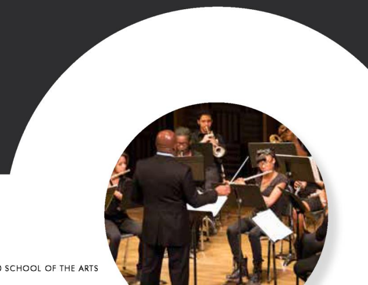
FRIENDS OF CLEVELAND SCHOOL OF THE ARTS