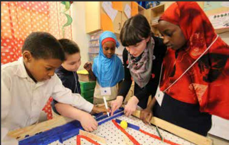
PROGRESSIVE ARTS ALLIANCE