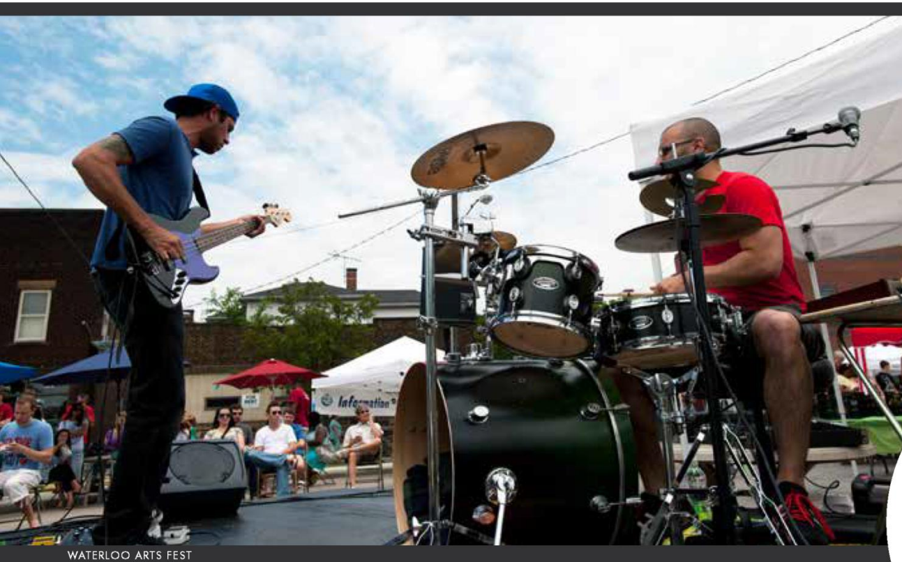
WATERLOO ARTS FEST

Each year, Cuyahoga Arts & Culture funds tens of thousands of events and programs that take place in communities throughout Cuyahoga County, which provide a wide array of activities for everyone to experience. These offerings enrich our quality of life, bringing people together to celebrate the things that make Cuyahoga County a unique place to live.