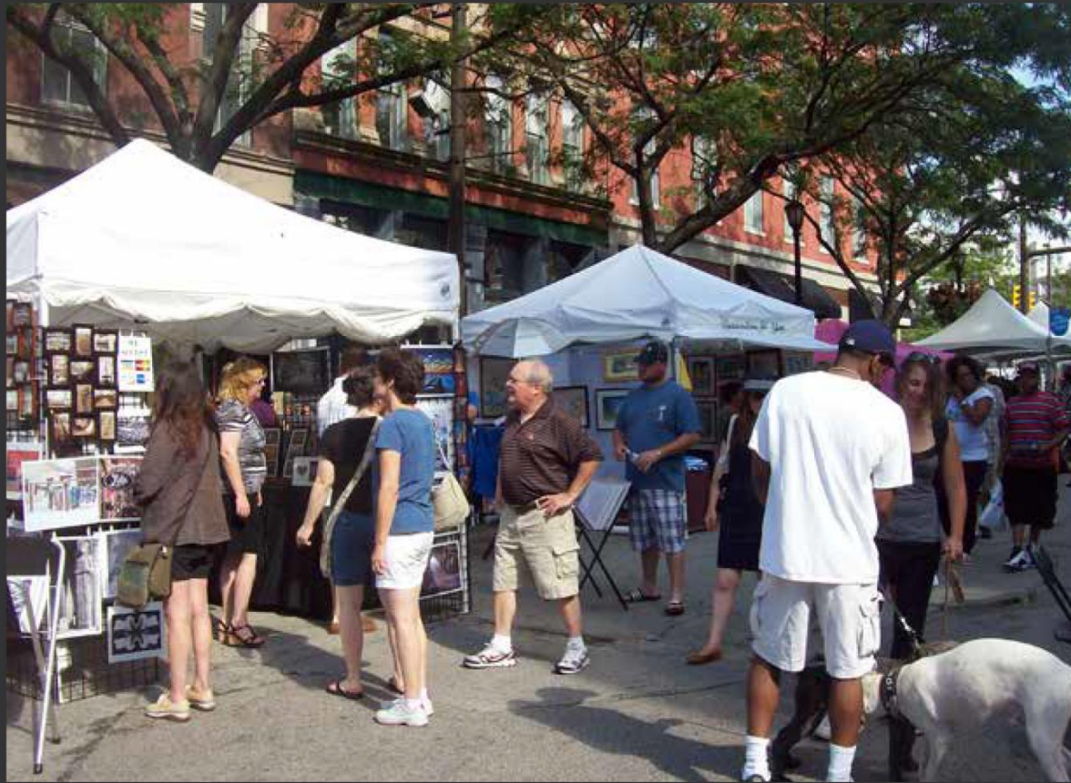
WAREHOUSE DISTRICT STREET FESTIVAL

Cuyahoga Arts & Culture funding helps build stronger, more resilient arts and culture organizations that, in turn, make an impact on the local economy. Visitors from the county, region, around the country, and around the world, enjoy our world-class arts and culture. And, companies based in Northeast Ohio cite Cuyahoga County's vibrant arts and culture offerings as key to attracting and retaining talented employees.