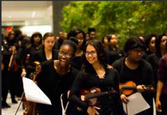
FRIENDS OF CLEVELAND SCHOOL OF THE ARTS