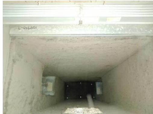
Picture of Damper in Closed Position