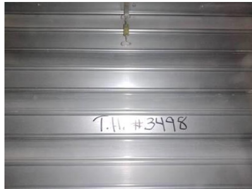
Picture of Damper I.D. Label