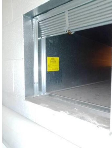
Interior Picture of Damper