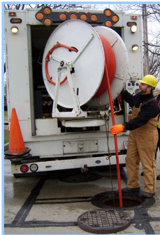
* Jet Truck

The Sanitary Engineering Division has an ongoing sewer flow-metering program. The in-sewer meters are primarily used to compare normal dry day flows to wet weather flows in sanitary main lines. The meters are also used to measure wastewater flows coming into treatment plants and water flows in storm sewers. Through the use of the flow meters, the Division can isolate areas affected by excessive volumes of clean runoff into the sanitary sewer system. Meters can detect extraneous water from illegal downspout connections or from rainwater infiltrating through the ground and into sanitary sewers through bad pipe joints and cracked or broken pipe.