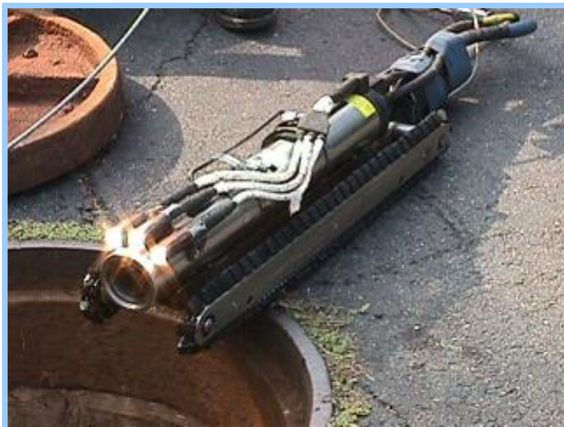
* Inspection Camera