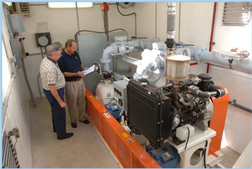
* Brainard Pump Station

The County operates 42 pumping stations throughout the county. A Supervisory Control and Data Acquisition (SCADA) system monitors 33 of the stations. The system provides alarms and operational status through a central computer that can be accessed from a remote computer. It is our goal to upgrade all County operated pump stations and to expand the SCADA system to all new projects including new pump stations that were installed in Pepper Pike and Gates Mills.