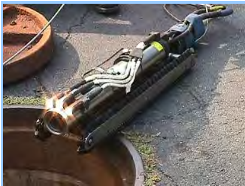
* Inspection Camera