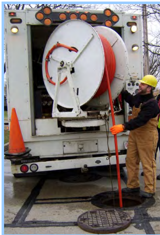
* Jet Truck

The Sanitary Engineering Division has an ongoing sewer flow-metering program. The in-sewer meters are primarily used to compare normal dry day flows to wet weather flows in sanitary main lines. The meters are also used to measure wastewater flows coming into treatment plants and water flows in storm sewers. Through the use of the flow meters, the Division can isolate areas affected by excessive volumes of clean runoff into the sanitary sewer system. Meters can detect extraneous water from illegal downspout connections or from rainwater infiltrating through the ground and into sanitary sewers through bad pipe joints and cracked or broken pipe.