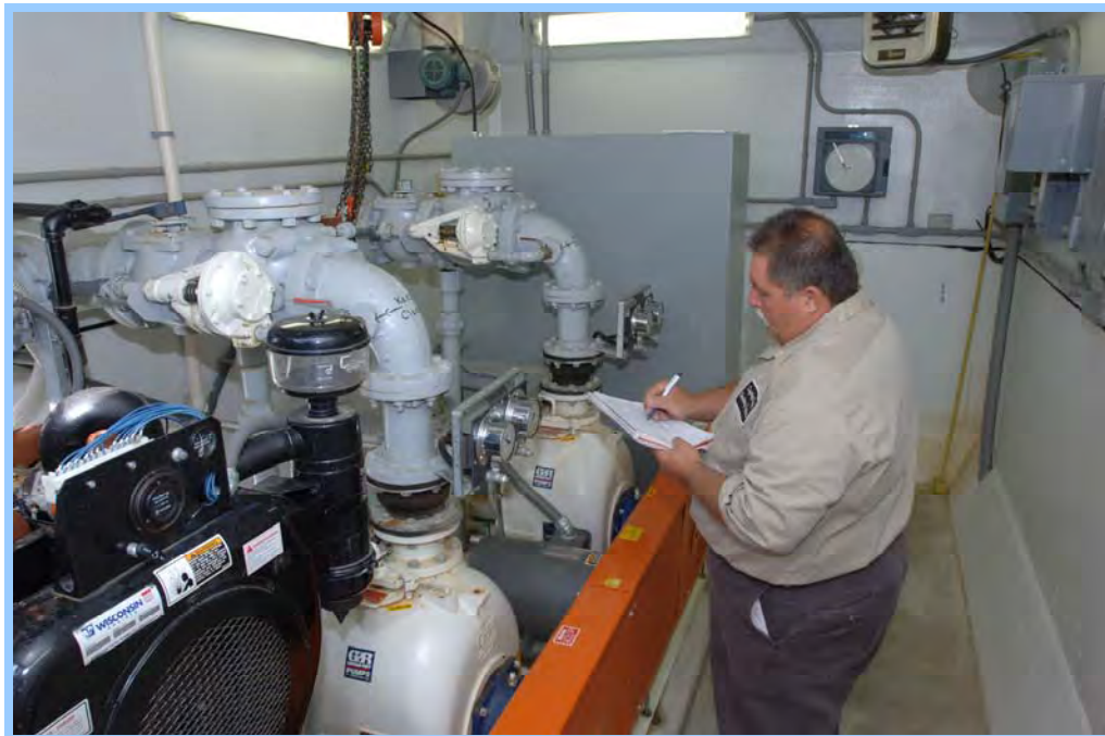
* Valley Ranch Pump Station

In addition, the Engineering Section coordinates and processes legislation, maintains files and legal libraries of pertinent federal, state and local laws and renders technical assistance to other sections regarding changes in laws or regulations. Working in cooperation with the Commissioners' legislative representative, it reviews and comments on legislation proposed in the Ohio General Assembly.