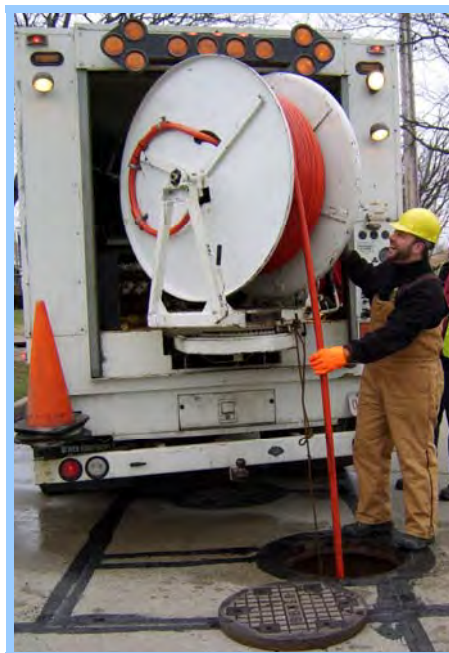
* Jet Truck

The Sanitary Engineering Division has an ongoing sewer flow-metering program. The in-sewer meters are primarily used to compare normal dry day flows to wet weather flows in sanitary main lines. The meters are also used to measure wastewater flows coming into treatment plants and water flows in storm sewers. Through the use of the flow meters, the Division can isolate areas affected by excessive volumes of clean runoff into the sanitary sewer system. Meters can detect extraneous water from illegal downspout connections or from rainwater infiltrating through the ground and into sanitary sewers through bad pipe joints and cracked or broken pipe.