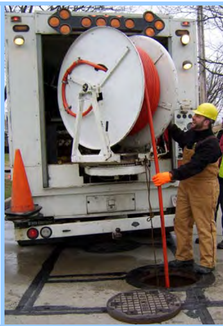
* Jet Truck

The Sanitary Engineering Division has an ongoing sewer flow-metering program. The in-sewer meters are primarily used to compare normal dry day flows to wet weather flows in sanitary main lines. The meters are also used to measure wastewater flows coming into treatment plants and water flows in storm sewers. Through the use of the flow meters, the Division can isolate areas affected by excessive volumes of clean runoff into the sanitary sewer system. Meters can detect extraneous water from illegal downspout connections or from rainwater infiltrating through the ground and into sanitary sewers through bad pipe joints and cracked or broken pipe.