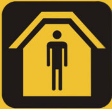
Shelter in Place